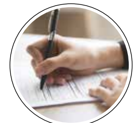
Articles of Association and Addendums