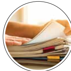
Translation of Documents