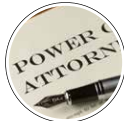
Power of Attorney