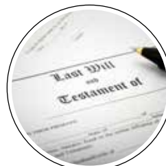
Registration of Will For Non-Muslims